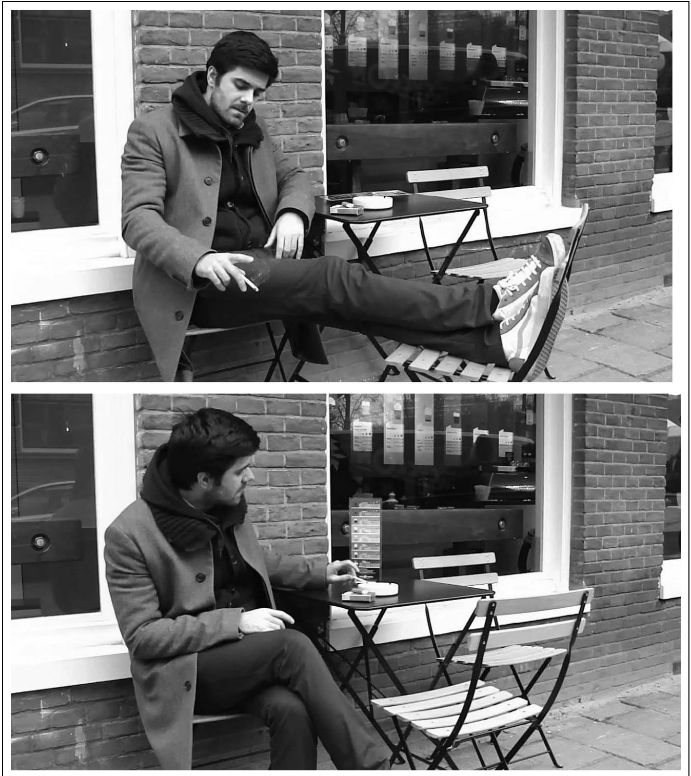
Figure 1. Screenshots from the norm-violation (top) and control condition (bottom) video clips (study 3)

“Bring me a vegetarian sandwich and a sweet coffee” (“May I have a vegetarian sandwich and a sweet coffee, please?”). The waiter says, “Right away,” and he does not reply (replies: “Thank you”). He puts out his cigarette on the pavement (in the ashtray).